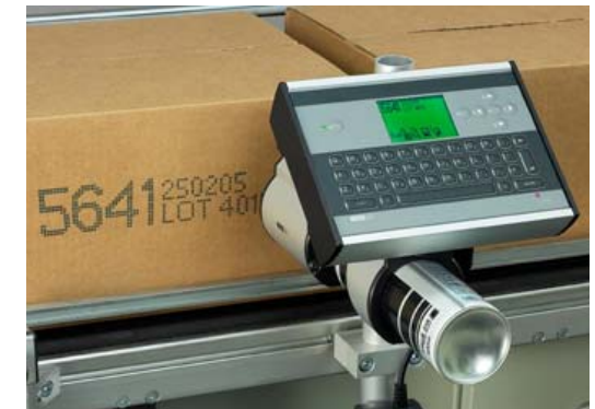
The printing can be on the top or the side of the product, as shown in the photo above.